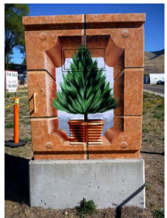
A Perspective on Trees Kip Herring September 2010 Stephens & Mount Acrylic