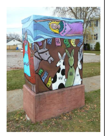
The Little Green Rabbit Laura Blaker Fall 2012 Brooks & Mount Paint