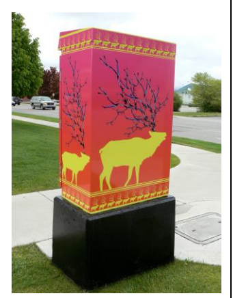
Fancy Elk Amber Bushnell Memorial Weekend 2011 39<sup>th</sup> / Reserve Vinyl Page 5 of 8