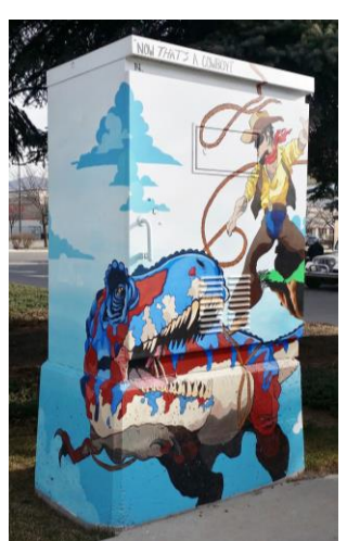
Now That's A Cowboy Lillian Nelson August 2015 Reserve & England Acrylic Page 1 of 8