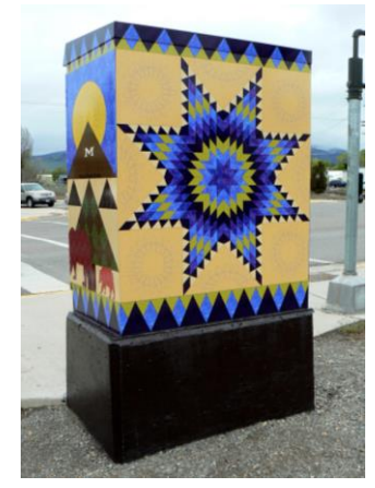
A Quilted Heritage Missoula Electric Quilters Memorial Weekend 2011 South / Johnson Vinyl