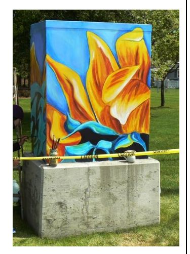
Bright Morning Stoney Sasser Memorial Weekend 2010 Reserve & 3<sup>rd</sup> Acrylic